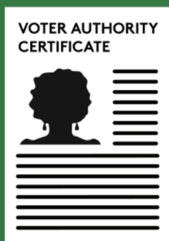
Free Voter Authority Certificate