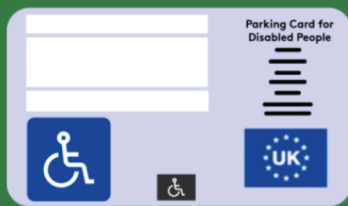
Blue Badge scheme card