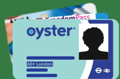
60+ Oyster photocard or a Freedom Pass