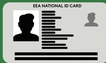
National identity card issued by an EEA state