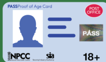
PASS card issued by the National Proof of Age Standards Scheme bearing the PASS hologram