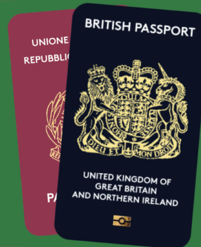
UK, Commonwealth or EEA passport